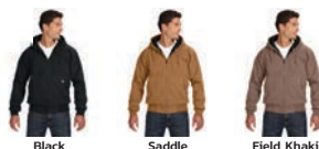
Black Saddle Field Khaki