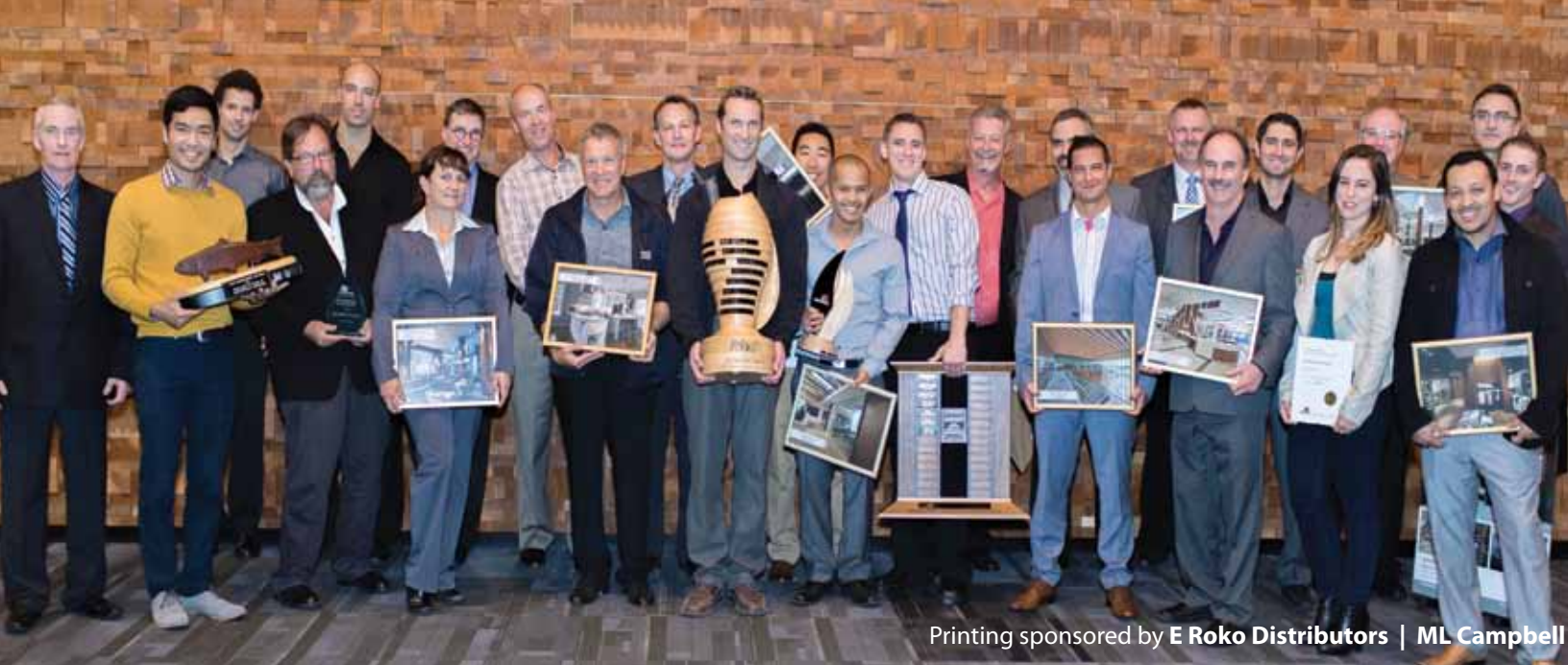
Printing sponsored by E Roko Distributors | ML Campbell