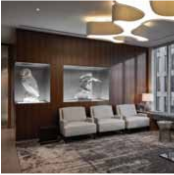
2. CLARK WILSON LLP Nikolai Manufacturing Kasian Architecture Priority Projects