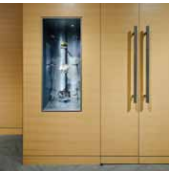
5. PRIVATE FIRM Feature Millwork Kasian Architecture Gamut Construction