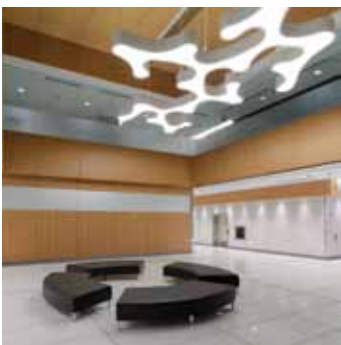
4. LOBBY RENOVATION 200 Granville Street JSV Architectural Veneering & Millwork Abbarch Architecture Ledcor Group