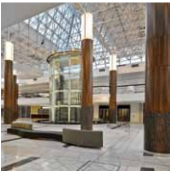
3. GUILDFORD TOWN CENTRE Wanes Custom Woodworks MCM Interiors Ledcor Group Surrey BC