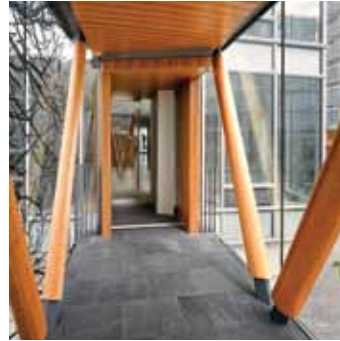
6. RIVER GREEN PARCEL 2 Woodrose Woodworking James K.M. Cheng Architects Ledcor Group Richmond BC