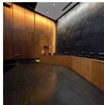
9. SURREY CIVIC CENTRE Towne Millwork Kasian Architecture PCL Constructors Westcoast