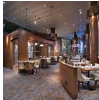
8. SHOWCASE RESTAURANT & BAR Towne Millwork False Creek Design Group Mondiale Development