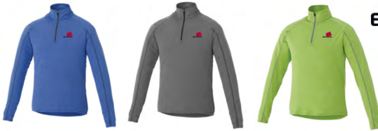
New Royal Heather