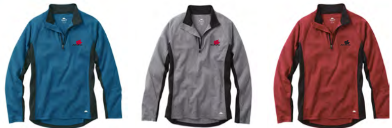
Pacific Blue Heather/Black